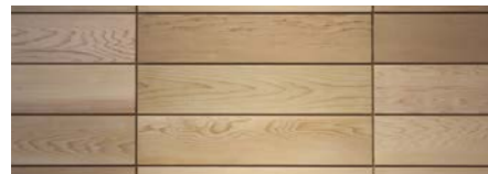
COLOUR: WESTERN RED CEDAR - RAW COLOUR CODE: RAW