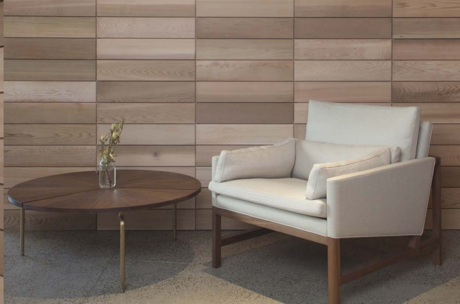
SLEEK TILE - RAW