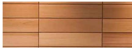
COLOUR: WESTERN RED CEDAR - CLEAR SATIN COLOUR CODE: CS