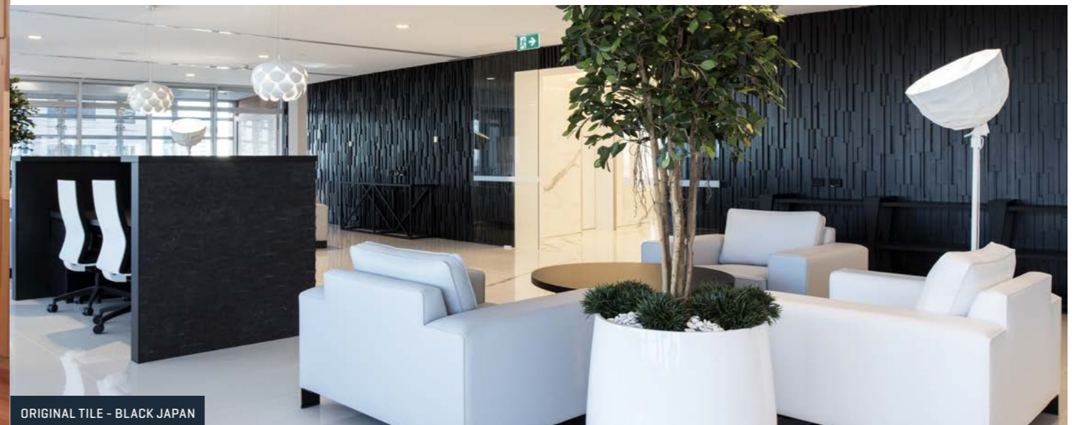
ORIGINAL TILE - BLACK JAPAN