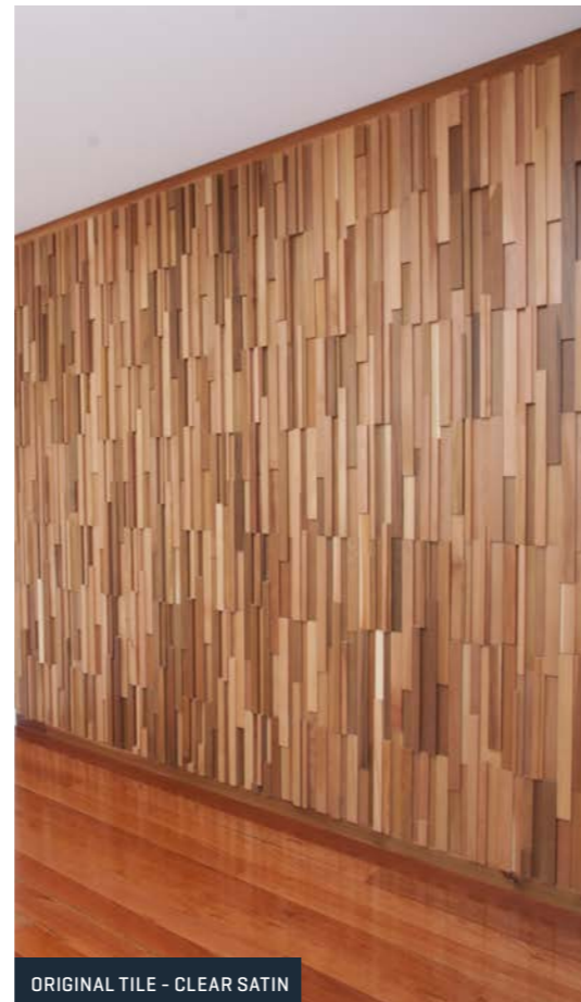
ORIGINAL TILE - CLEAR SATIN