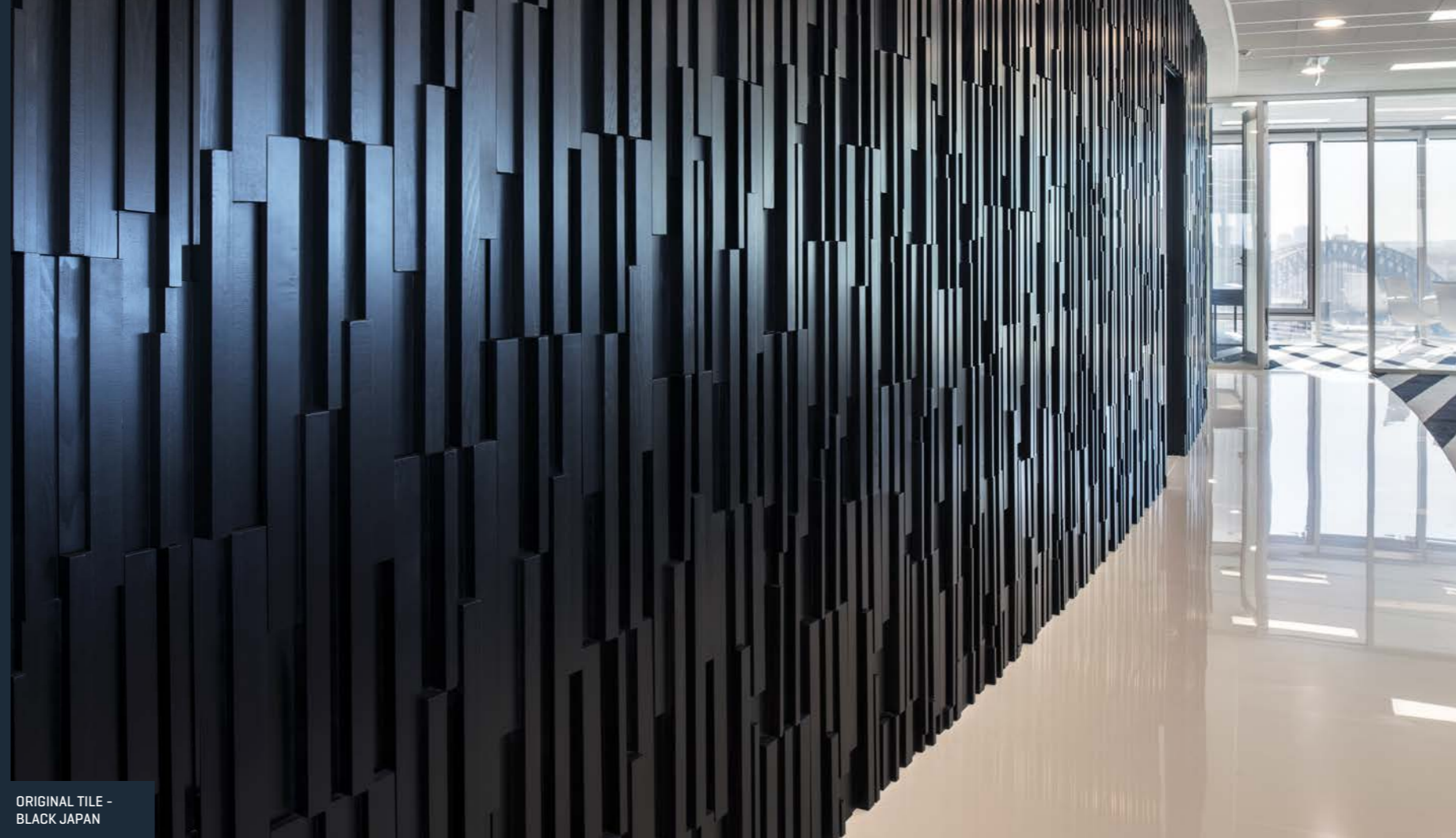
ORIGINAL TILE - BLACK JAPAN